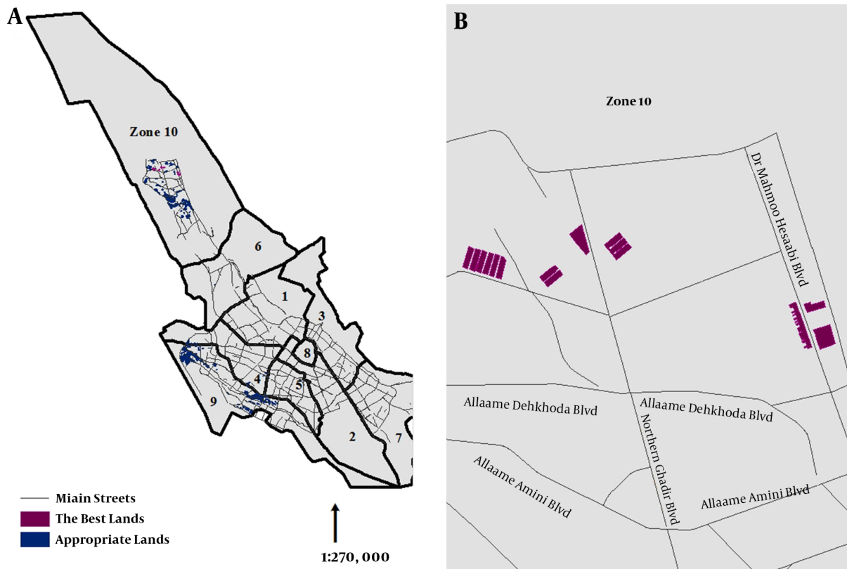
Figure 2. Appropriate Lands for Establishing Hospitals Based on the Applied Criteria

than constructing other facilities. It is also recommended to health authorities to use GIS to make sure that other health resources are spent in appropriate locations.